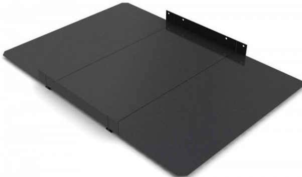
Figure 2: Base Cover.