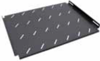
Figure 3: Fixed Tray