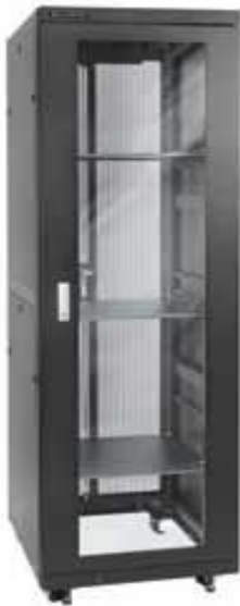
Figure 1: 42RU Cabinet.

All measurements are external dimensions.