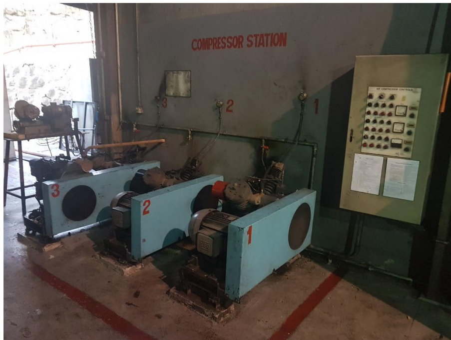
Figure 1 Current Setup

Air Compression units should operate within a tolerance of approx. 50 psi for maintain the desire pressure. The Unit should incorporate one primary, one standby compressor unit and third diesel blackstart compressor. The current setup is shown in the Figure below.