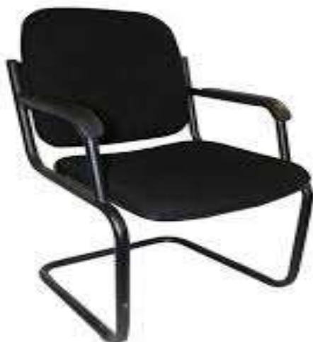
Euro visitors chair with arm rest