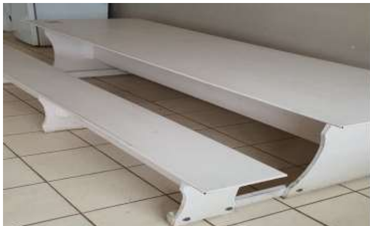
Eating Table Design