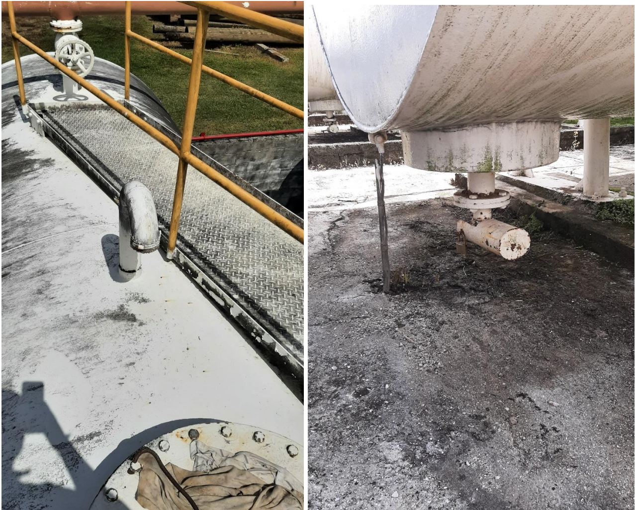
Figure 1-8: 4 X IDO tank at Labasa Power Station