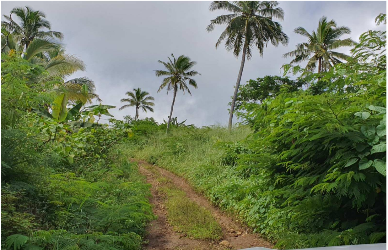
Figure 1-4: Site pictures of the current access road